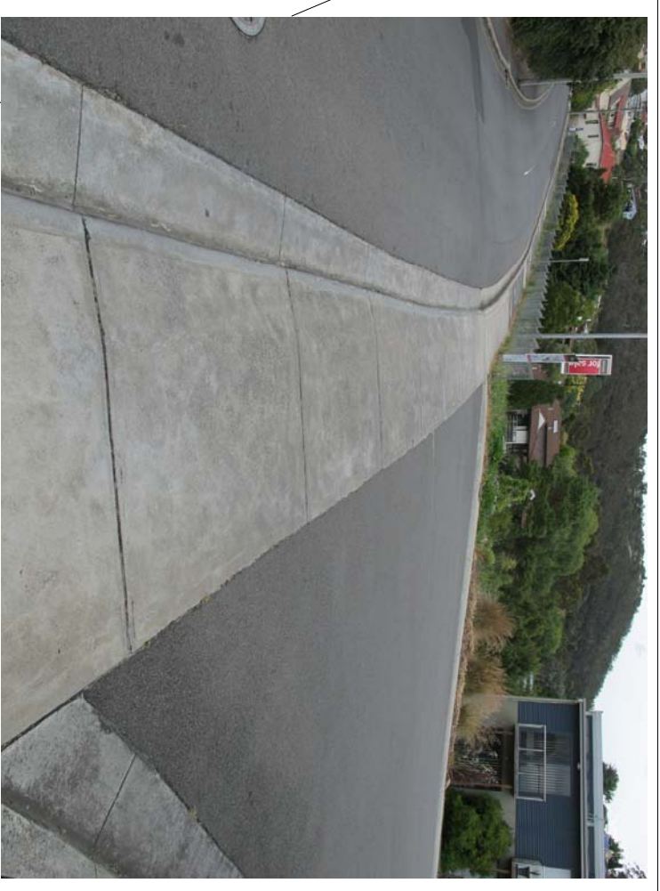
DEVELOPMENT ACCESS AT 30 WATERWORKS RD